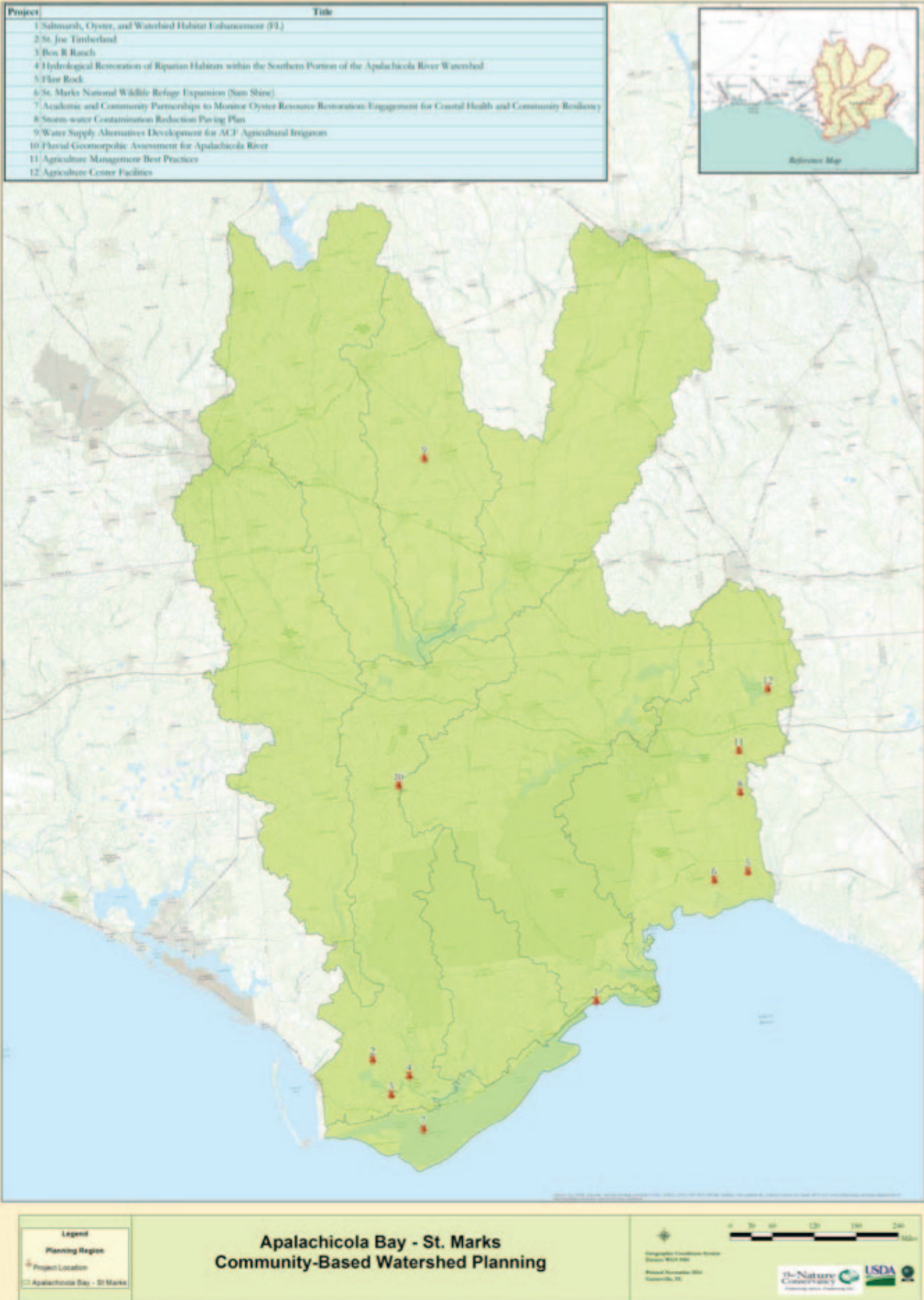
Figure 1. Apalachicola Bay to St Marks Watershed Project Map